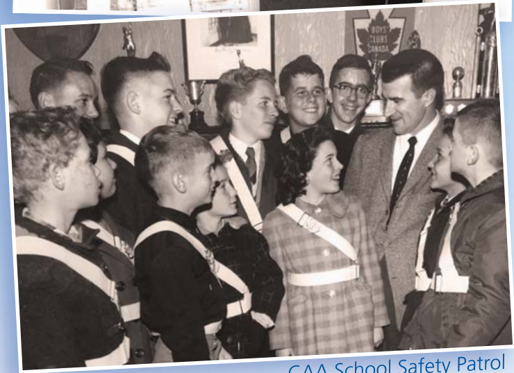
CAA School Safety Patrol

"We're an organization that's more than just a car. You're joining something that's a whole lot different today that you might have thought."